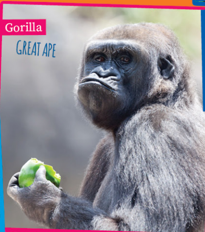
Gorilla GREAT APE