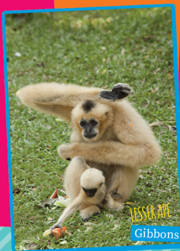
LESSER APE Gibbons