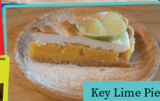
Key Lime Pie